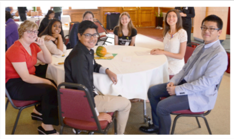
The attending Eco-Heroes.